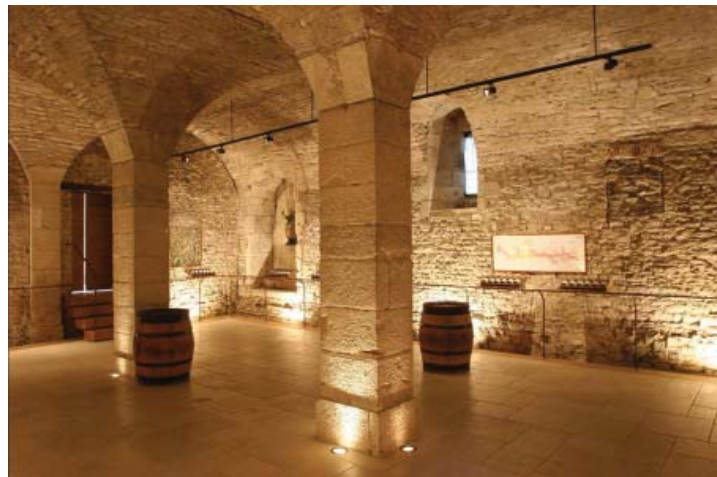
The Parlement above Drouhin's cellars