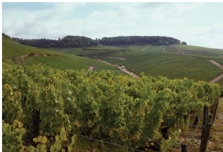
The Grand Cru hillside in Chablis